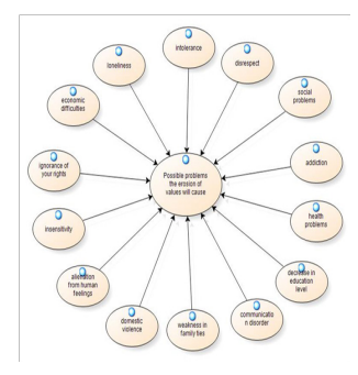
Figure 6. Findings Regarding the Possible Problems the Erosion of Values Will Cause

erosion in values experienced during the pandemic cause in the future?" and the answers given to the question are shown in Figure 6.