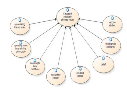
Figure 5. Causes of Positively Affected Values During the Pandemic Period

The factors that enable the values to develop positively during the pandemic process are presented in Figure 5.